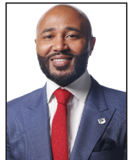
MO WILLIAMS Head Coach Third season